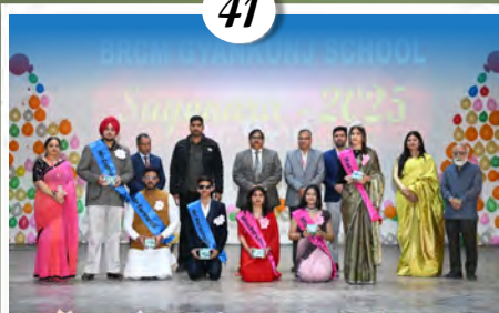
"SAYONARA" Farewell Party of BRCM Gyankunj School