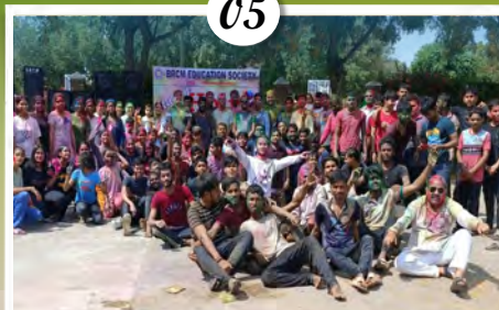
Celebration of Holi at BRCM Vidyagram Campus