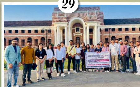
Educational Tour cum Field Survey by the Department of Geography