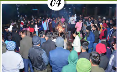
Celebration of Lohri and Makar Sankranti at Vidyagram Campus,