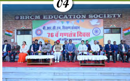
76 th Republic Day Celebration at Vidyagram Campus, Bahal