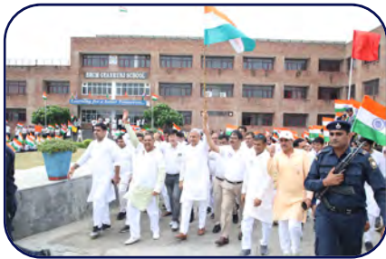
Har Ghar Tiranga Rally & Azadi Ka Amrit Mahotsav