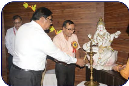
Engineer's Day Celebration at BRCM CET