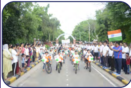
Fitness Run for Staff and Cycle Rally for Kids