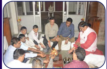
Havan Pooja at new BRCM ES Office