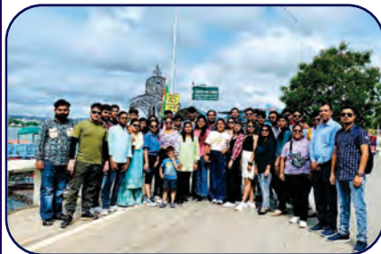
Educational Tour of BRCM Law College