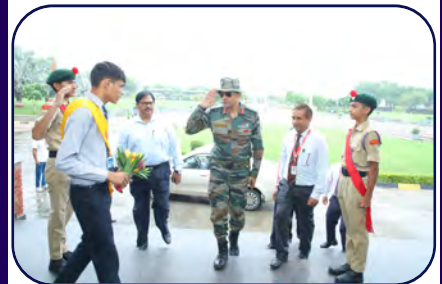
Inspection of BRCM Gyankunj School for Sainik School