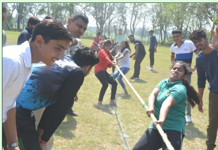
Students participating in Volleyball Match and Tug of war