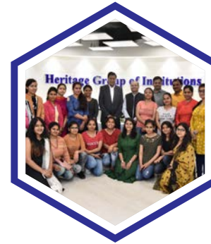
Educational Tour to Kolkata Pg. 21