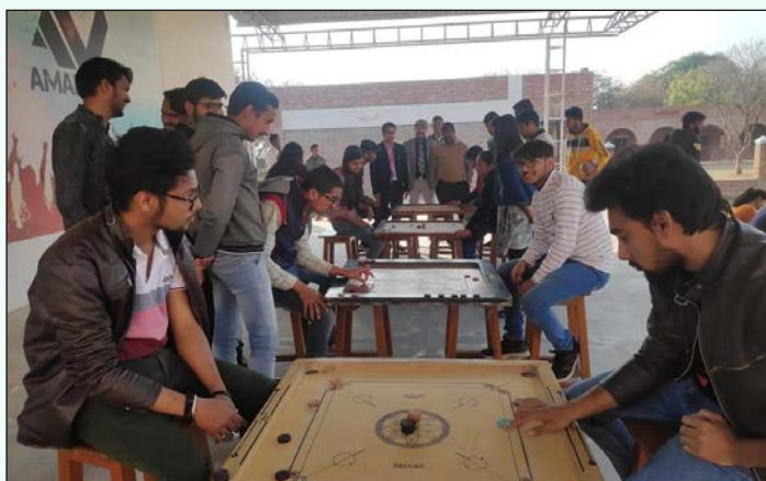
Carrom Championship at BRCM-CET

The Sports Department of BRCM CET, Bahal organized a Carrom Tournament on 12th February 2020 and 13th February 2020 in which 46 students (Boys & Girls) participated in this tournament. Total 43 matches were played in this tournament. Overall response of the students was excellent.