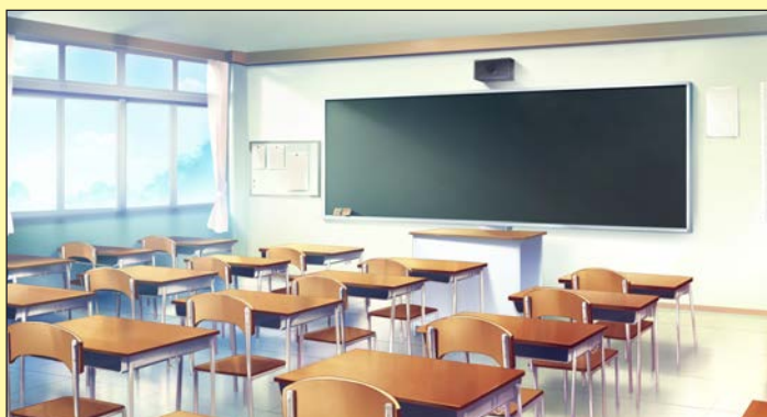
Physical Class Room without Students

At present, we can say that classroom teachers have become more of virtual teachers, learning has shifted from classroom to PC, Laptop, Mobile, I-Pad, Tablets etc and evaluation and assessment has given new challenges to teachers, students and parents. COVID – 19 has completely changed teaching-learning process and Education has become more of technology oriented which has given new challenge to both teachers and students. There were lots of debates and discussions on different platforms through webinars to find out merits and demerits of online teaching and their inclusion into the education system during post lockdown period. The educational leaders believe that yesterday was time of classroom teaching, today is online teaching and tomorrow will be the time of hybrid teaching. Time is only going to tell that which mode of education will continue in future to give best education to the technology age students but it can be predicated that in future online education can become culture in our education system. .