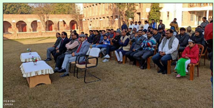
Audience during Republic Day Celebration