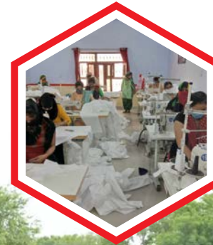
PPE KIT Production at SDTC Pg. 37