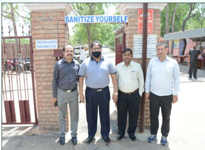
Installation of Sanitizer Pass Way at Main Gate of BRCM Vidyagram Campus