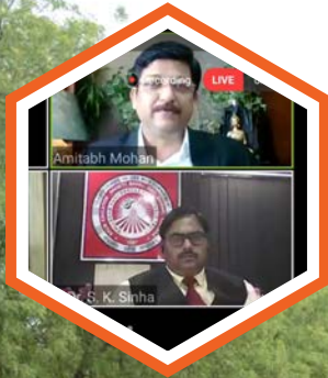
National Webinar at BRCM ES Pg. 29