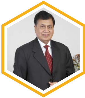
Chairman's Message Pg. 2