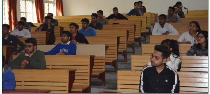
Students during “C Language” workshop