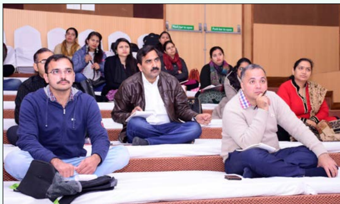
AICTE sponsored FDP at DCRUST, Murthal