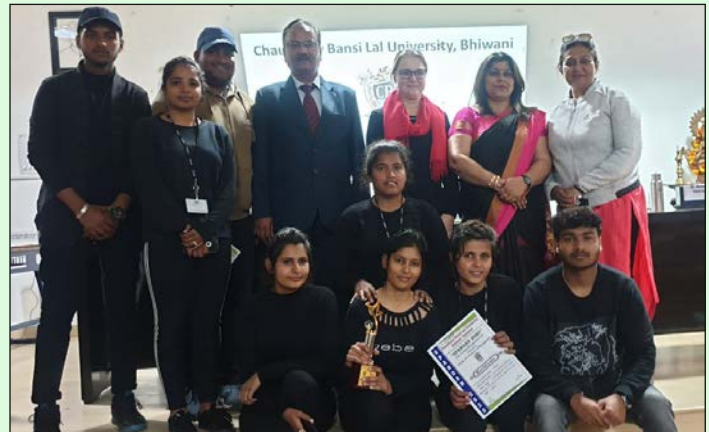
Winners posing a click with Hon'ble VC (CBLU) and other dignitaries