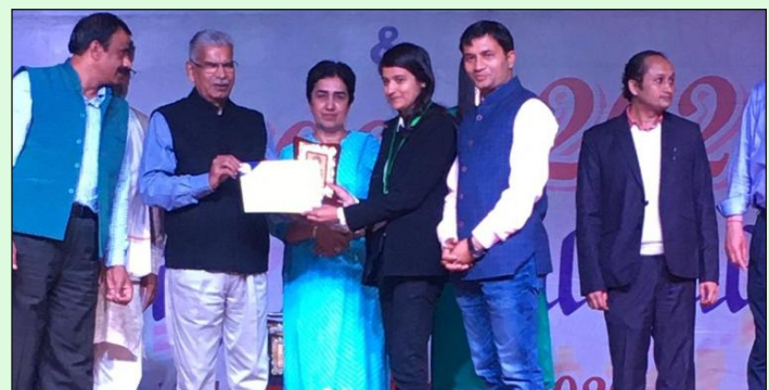
Receiving Prize from Authorities