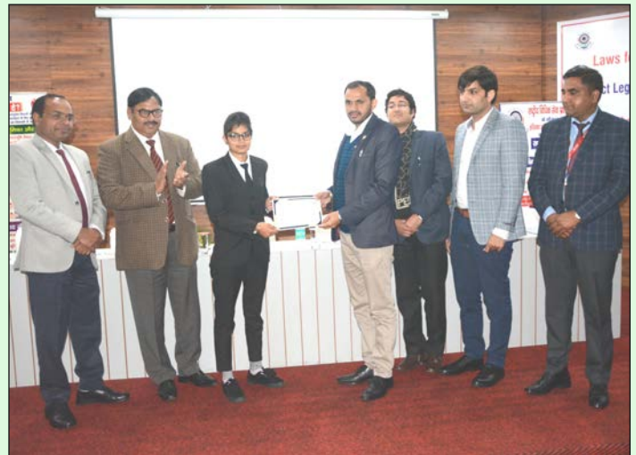
Participant receiving prize from Chief Guest