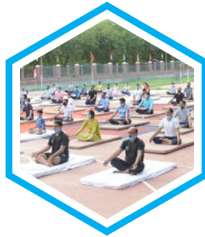
Yoga Day Celebration Pg. 3