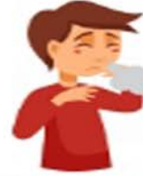
Hard to breathe