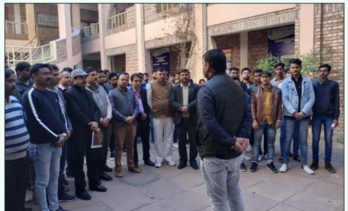
Tribute to all martyrs of Pulwama Terror Attack at BRCM CET

“If you're a true warrior, competition doesn't scare you. It makes you better”:-Andrew Whitworth; Payed tribute to all martyrs on 1st Anniversary of Gruesome Pulwama Terror Attack: The black day of February 14, 2019, when the whole nation was in tears due to the martyrdom of its 40 soldiers. All the staff members and students of BRCM College of Engineering and Technology, Bahal (Bhiwani) paid tribute to the martyrs of Pulwama terror attack. All the staff members and students garland the photos of martyrs and lit the traditional lamp.