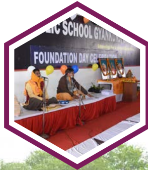
BRCM School Foundation Day Celebration Pg. 30