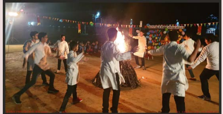
Bonfire lit by Junior Students on Lohri

Our School celebrated Lohri and Makar Sankranti festivals with great zest and joy in Vidyagram premises. Special function in the evening was organised. Speeches in Hindi and English were delivered by the students. Students performed Bhangra around bonfire. The Principal in his speech told the students about the significance of the festivals. Peanuts and Reweri were distributed to all.