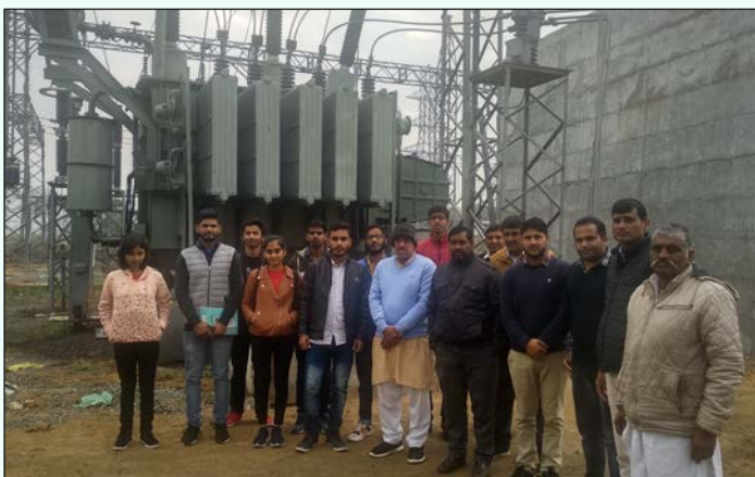
Students Visit at DHBVNL, Bahal (Bhiwani)

An industrial visit to Dakshin Haryana Bijli Vitran Nigam Ltd. (DHBVNL) Bahal was organized on 27th January 2020 by the department of Electrical Engineering under the guidance of Dr. Vivek Kumar, Associate Professor & HOD. Students are able to learn practical knowledge about power distribution and different protection devices used in substation. They received the information to read the one line diagram of power substation using different symbols used in diagram. Students gained practical knowledge of transformer as how to step down the voltage from 132 KV to 11 KV.