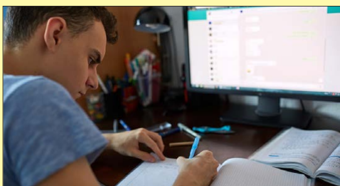
Remote Learning from Home

The work from home for teachers and remote learning by students has given new challenges to the learners depending upon the availability of digital infrastructure for the rural and urban area students. It has been found that urban and semi urban population of our country are having desired basic infrastructure for digital learning such as broadband, network connectivity etc. Moreover, availability of Smart Phones, Tablets, I-Pads, PCs and Laptops etc., to all student of both rural