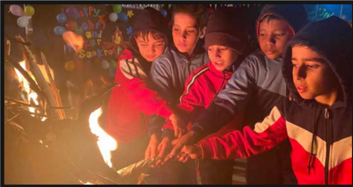
Bonfire lit by Junior Students on Lohri