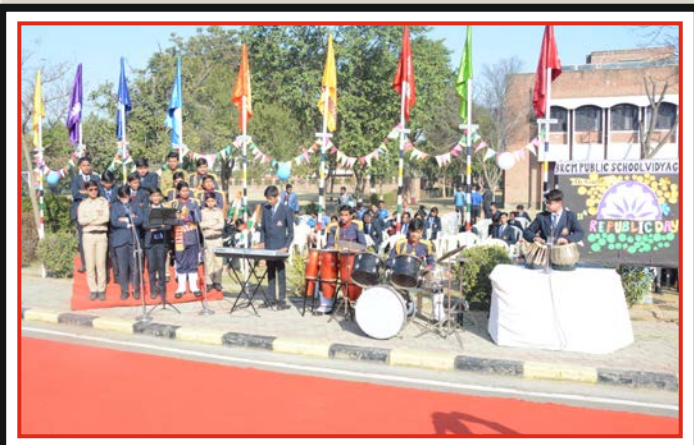
School Choir Singing Patriotic Song

The Chief Guest in his address highlighted the significance of the day and made the children aware that the future of their country lies in their hands. He went down the memory lane of his school days which he spent in Vidyagram School. He gave all the credit of his achievements to his teachers and school. Vote of thanks was proposed by the Principal. The programme ended with a lot of happiness and patriotic feelings.