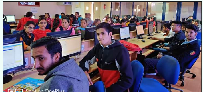
Workshop conducted by Network Bulls