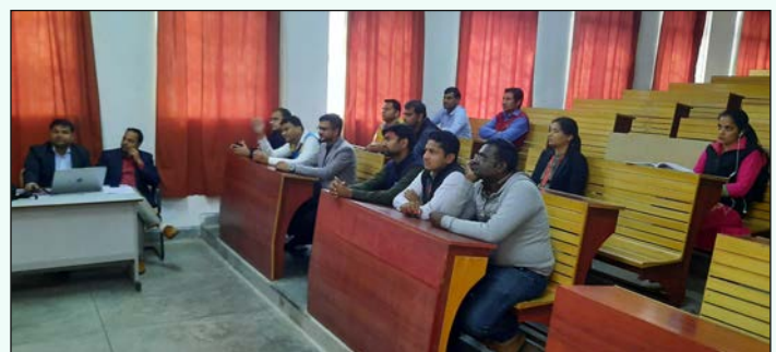
Staff members attending the Workshop