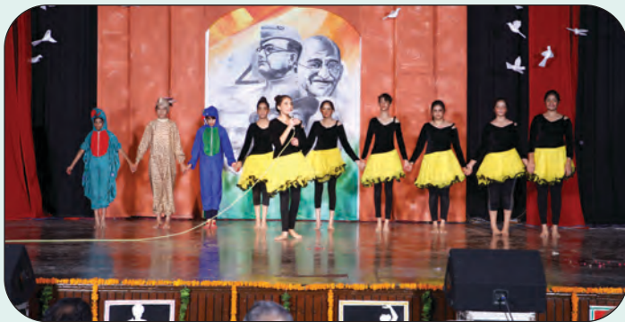
A Ballet on Protect Animals