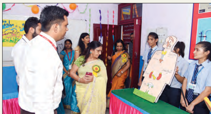
Visitors & Dignitaries visiting Science Exhibition