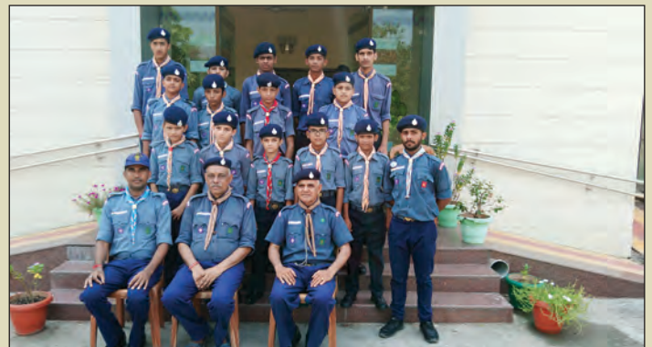
"Rajya Puraskar & Tritye Soapan Scout Training Camp