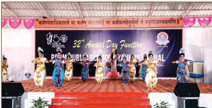
'Saraswati Vandana' presented by Students