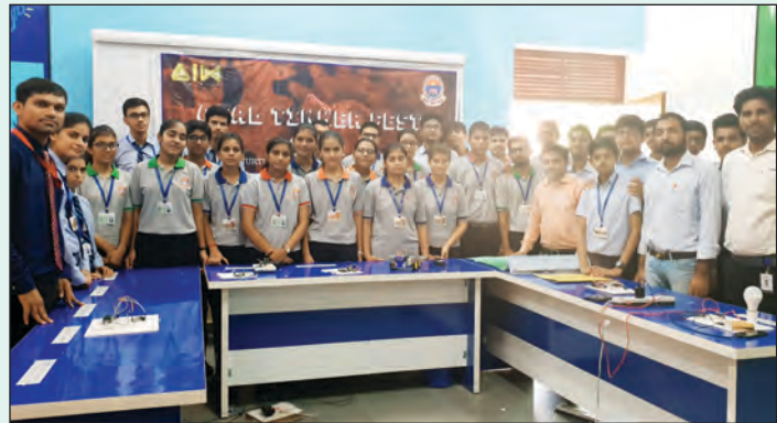
ATAL Tinkering Fest - Students of Gyankunj & Vidyagram

A Two Day "Atal Tinkering Fest" was organised in BRCM Public School Vidyagram wherein more than 80 students of Vidyagram & Gyankunj participated in it. The event started with an interactive session when students learnt about Artificial Intelligence, Science & Technology, Engineering and Mathematics. This was followed by a Robotics Workshop on the next day. Students made various electronic projects using sensors batteries.