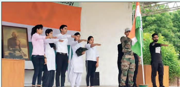
Law students presented 'SKIT'