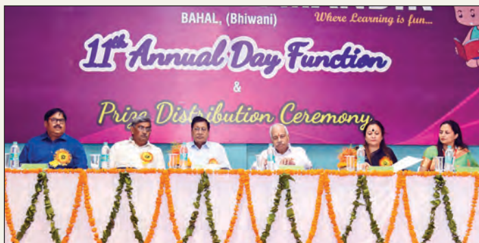
Dignitaries on the Dias