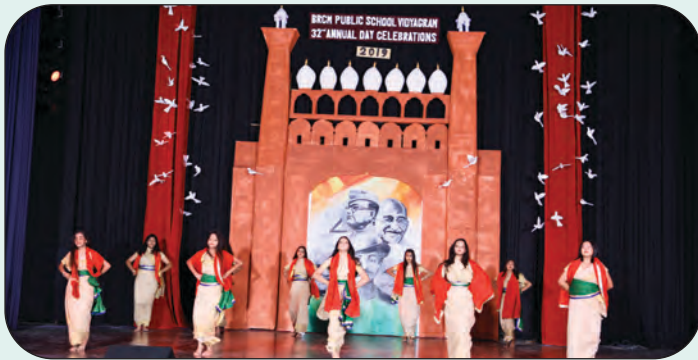
'Bordoisila' - Assamese Performance