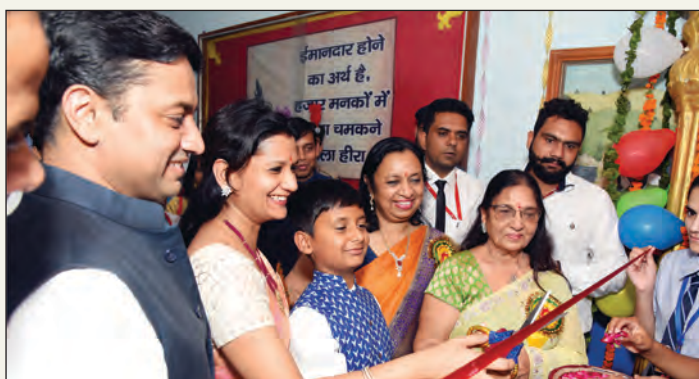
Inauguration of Science Exhibition