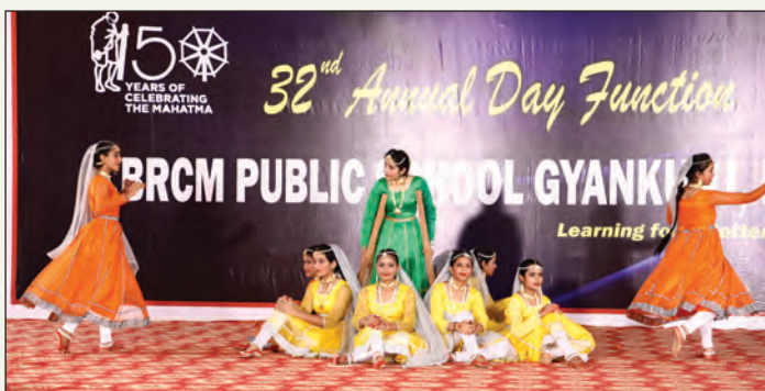
'Never Give up' Dance