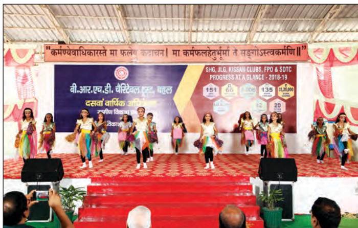
नन्हे कदम के बच्चों द्वारा प्रस्तुत "सामुहिक नृत्य"