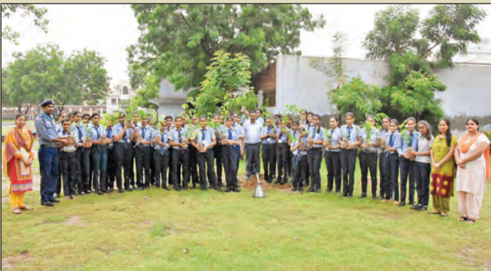
700 Students participated in Paudhagiri Green Abhiyan