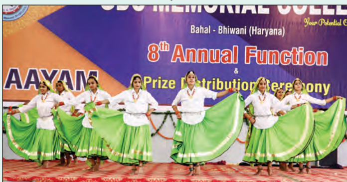
Haryanvi Folk Dance