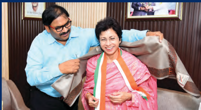
Kumari Selja, Member of Parliament (Rajya Sabha) & Congress President of Haryana