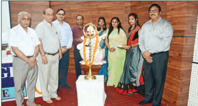
Dignitaries during Lamp lighting Ceremony