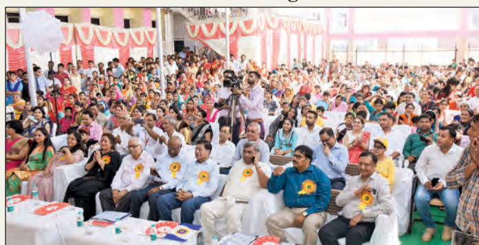
Audience Enjoying the Cultural Programme