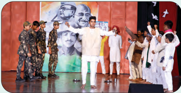
Jai Jawan, Jai Kisan