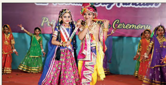
Radha-Krishan Yugal Dance