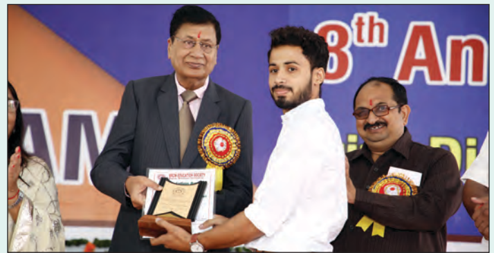
Prize Distribution to the Student