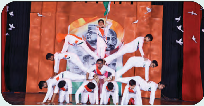
Value of Freedom and Valour