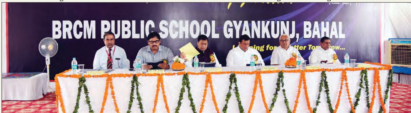
Dignitaries on Dias during Annual Day Functions - 2019