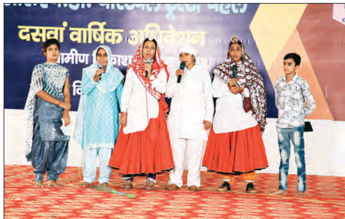
स्वयं सहायता समुहों के सदस्यों द्वारा प्रस्तुत "लोक गीत"