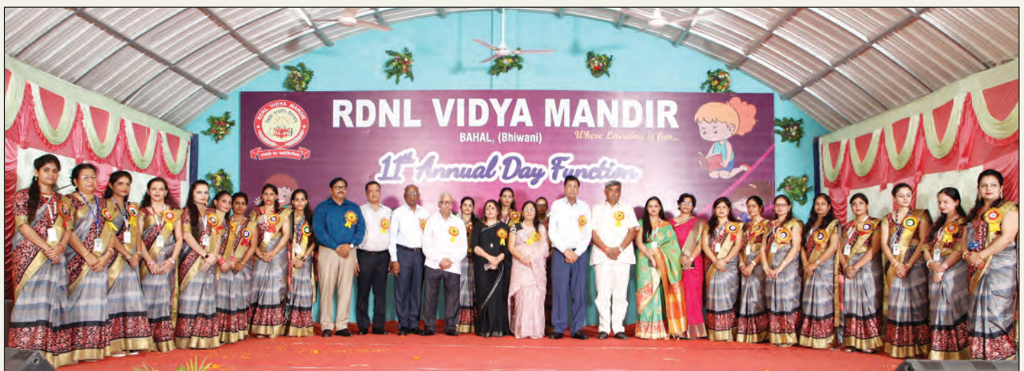
Dignitaries with Staff of RDNL Vidya Mandir