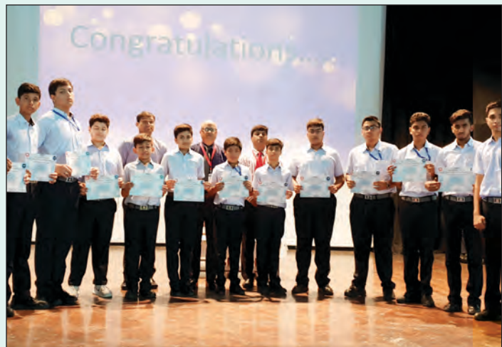
Tarang - 'Freshers' Evening with Principal

Freshers Party "Tarang" was organised on 30th July in the beautiful decorated auditorium. Principal in his speech welcomed the new comers formally and briefed about the culture of the school and what is expected of them. The new comers took the golden opportunity in not only introducing themselves but also showcasing their talents in singing, playing Guitar and Casio.