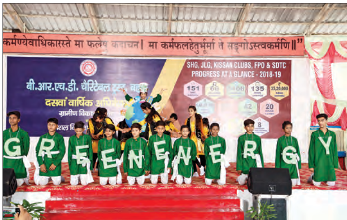
नन्हे कदम के बच्चों द्वारा प्रस्तुत "डांस ड्रामा"