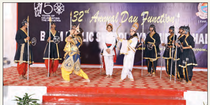
Demonstrating 'Geeta Rahasya'