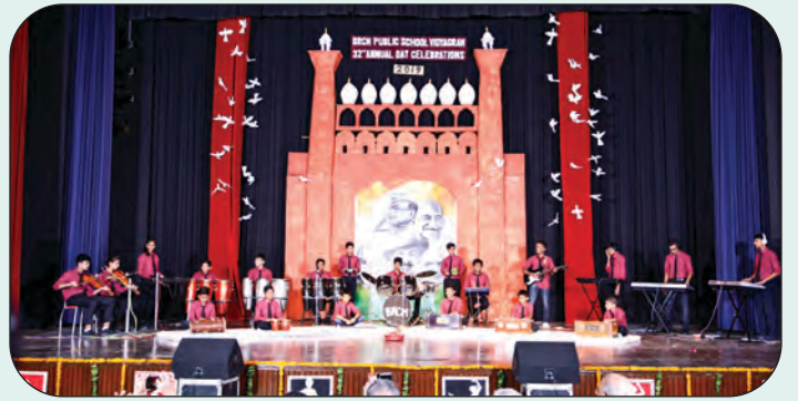
Beats of Orchestra