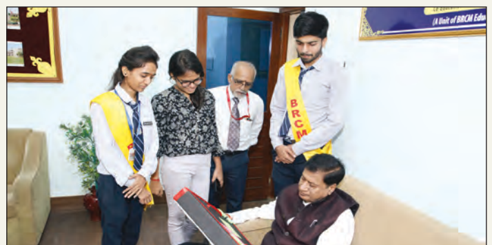
Students presenting Photo Album to the Chairman