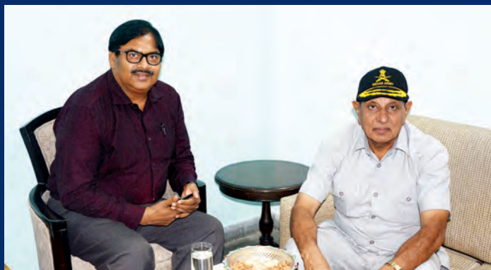
Lt. Gen. D.P. Vats, PVSM, SM, VSM (Retd.), Member of Parliament, Rajya Sabha