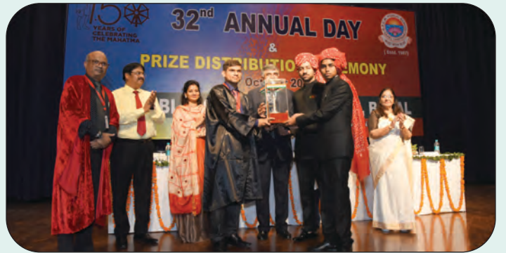
House of Excellence Trophy