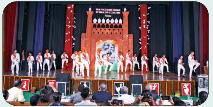
Value of Freedom and Valour