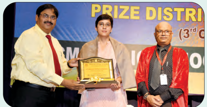
Memento Presentation to Guest of Honour