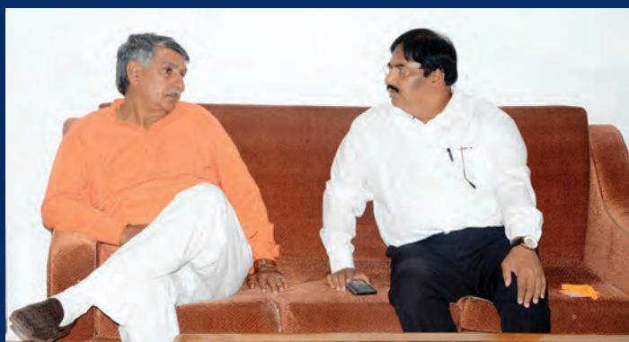
Sh. Dharambir Singh, Member of Parliament, Bhiwani-Mahendragarh (Lok Sabha Constituency)