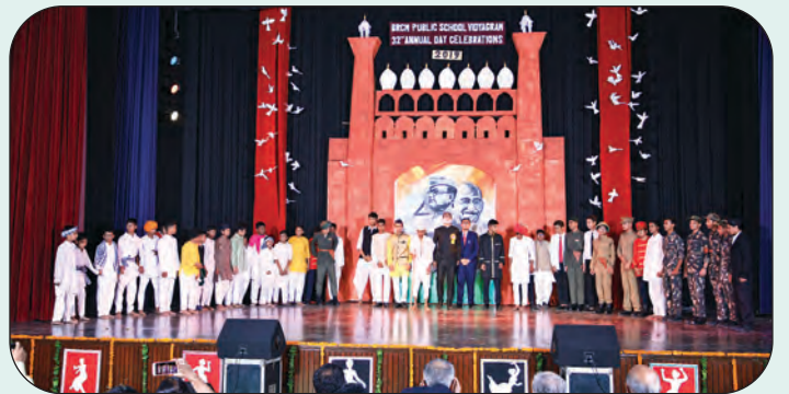
My Country My Pride