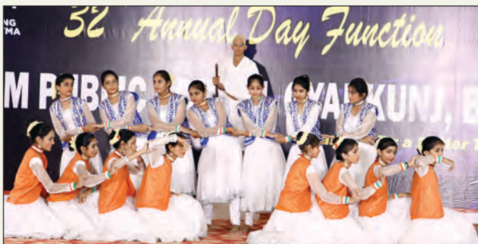
'Gandhi's Life' - Dance Drama