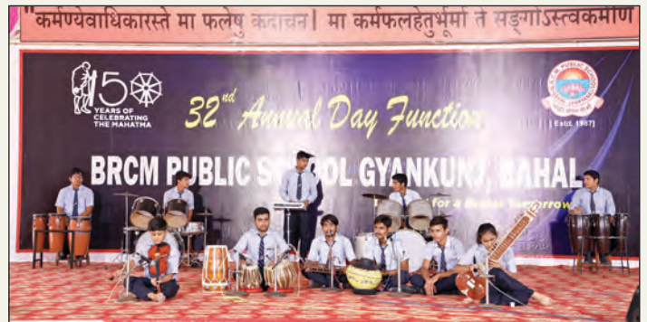
School Orchestra Show