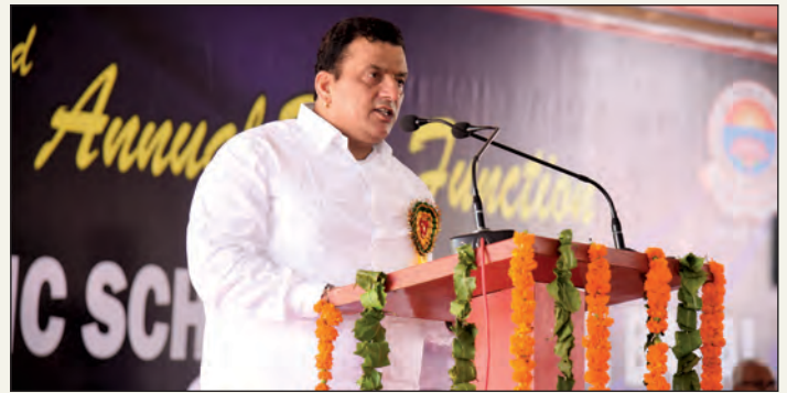
Motivational Speech by Swami Dharambandhu ji