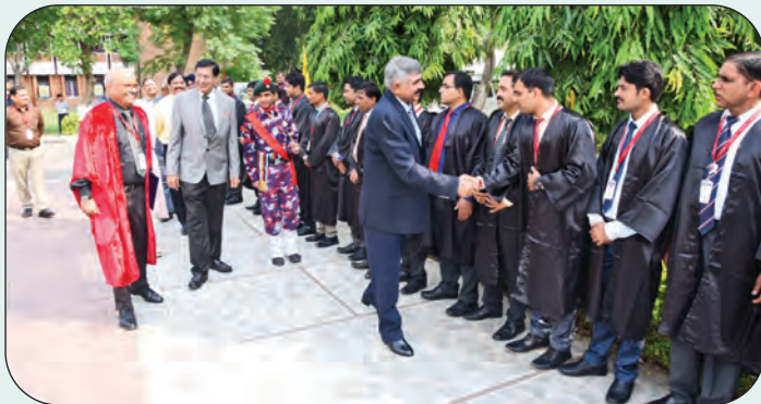
Chief Guest is being introduced to Teachers

A rainbow of Cultural programme unfolded, showcasing the talents of the students in various performances. The Country of Mahatma, a Hindi Drama was very well received by the audience. Assamese Dance stole the hearts of everyone. Old Boys of batch 2003, along with their families went down the memory lane on the occasion of Alumni Day on 04th October. In the special assembly the old boys shared their experience of School days and also informed the students about the challenges they faced after school in the outside world.