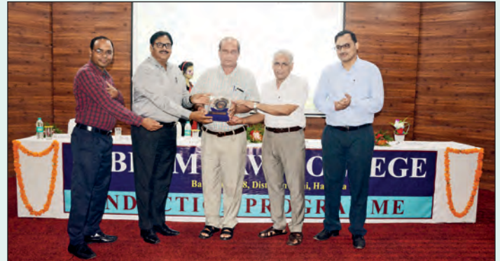
Dignitaries presenting Memento to the Chief Guest