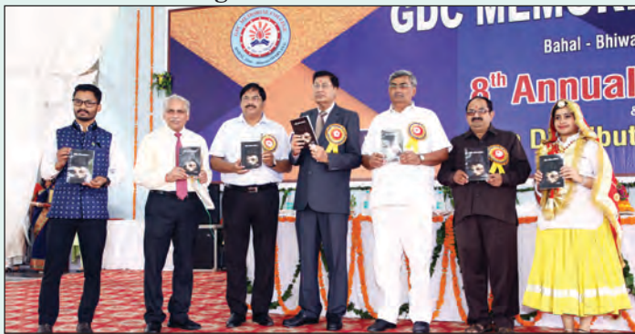
Releasing of Book Written by the Student