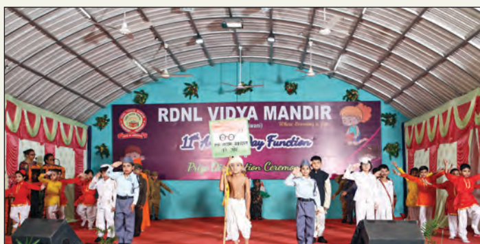
Swachh Bharat Skit