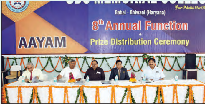
Dignitaries on the Dias