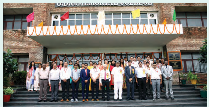
Staff of GDC Memorial College with Dignitaries