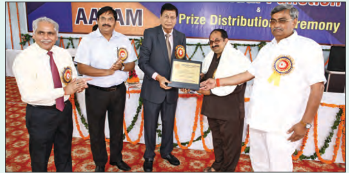
Memento Presentation to the Chief Guest