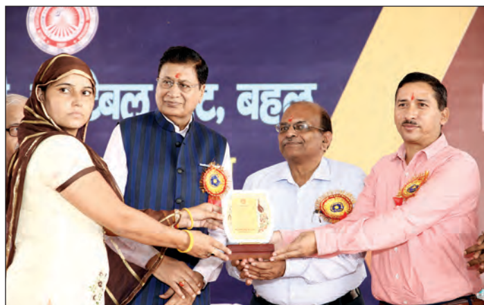
पुरस्कार वितरण समारोह