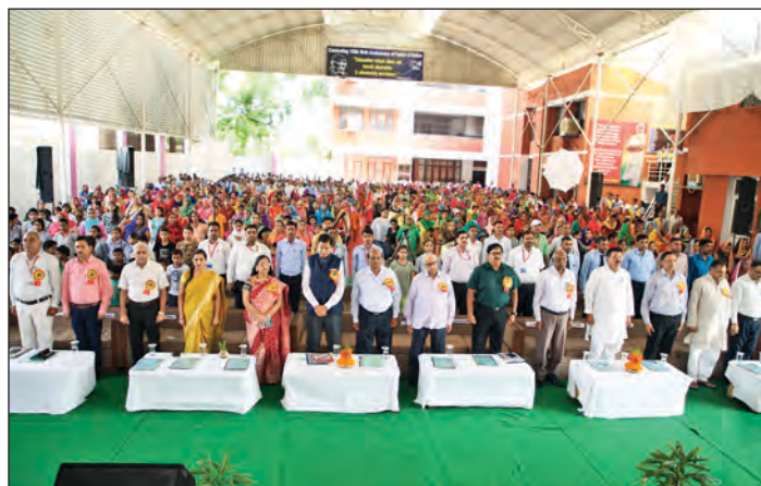
राष्ट्र गान के दौरान अतिथिगण एवं सभागार