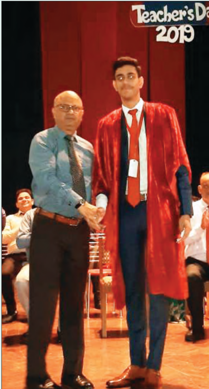
Principal with Head Boy on Teacher's Day

'A Great Teacher can inspire hope ignite imagination and instill'