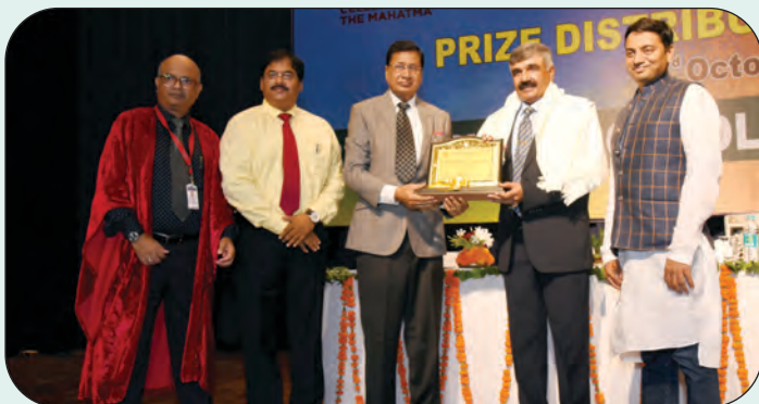
Memento Presentation to Chief Guest