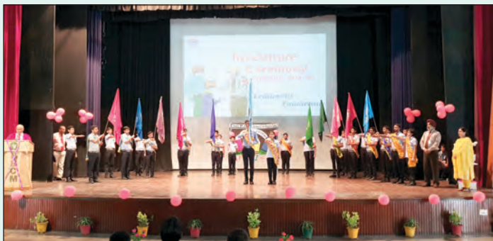
The Office Bearers - Investiture Ceremony-2019