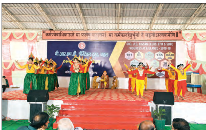
नन्हे कदम के बच्चों द्वारा प्रस्तुत "गणेश वन्दना"