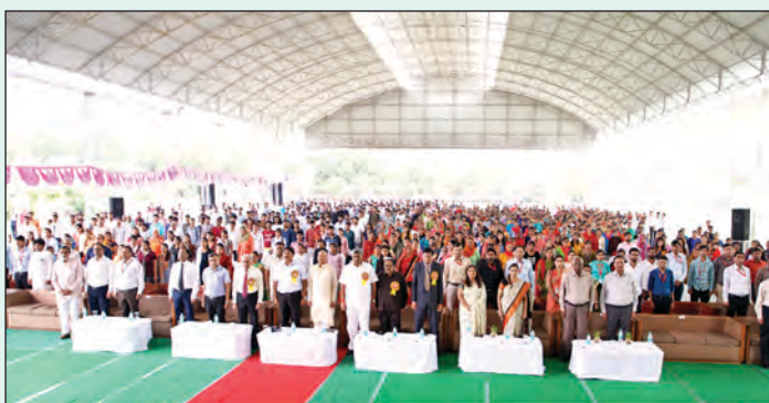
Dignitaries & Audience during National Anthem