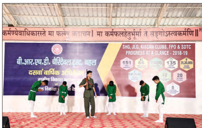
नन्हे कदम के बच्चों द्वारा प्रस्तुत "नाटक"