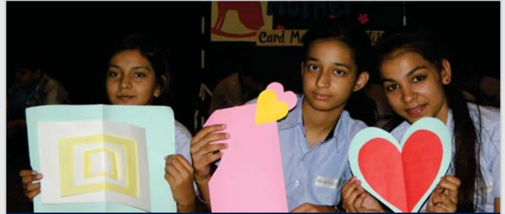
Mother's Day Card Making Competition