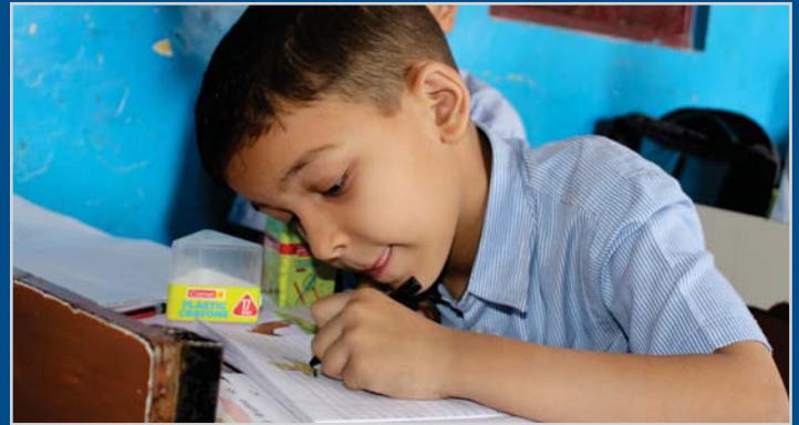
14 April, 2018 - Open Painting Competition on "Ambedkar Jayanti"