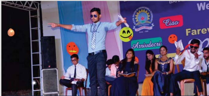
Students performing a 'Play' on college life

Raabta-2K18' was organized by B.Tech. 3rd year students to give farewell to their seniors on 6th April 2018 with a joy. The evening offered complete entertainment with tough competition among 4th year students for the titles which reflected their multi dimensional personalities.