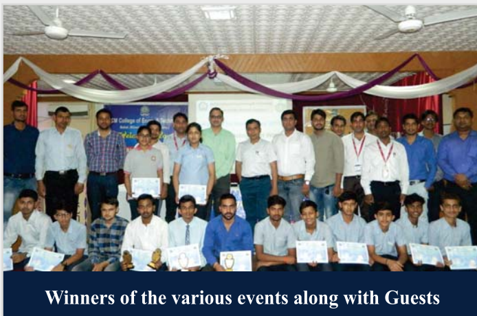
Winners of the various events along with Guests