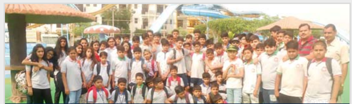
The radiant faces of students at Splash Water Park, Hisar

The school organized a trip to ‘Splash Water Park’ at Hisar, for junior students. Various rides and water games were enjoyed by the students. The radiant faces of the students beaming with happiness returned to the school with content. It was a very enjoyable trip.