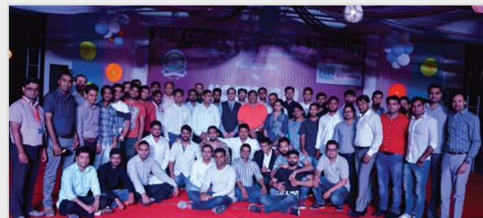
Participating Alumni along with College Dignitaries during Cultural Night

A large number of alumni, students and staff gathered