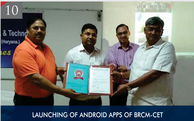
LAUNCHING OF ANDROID APPS OF BRCM-CET