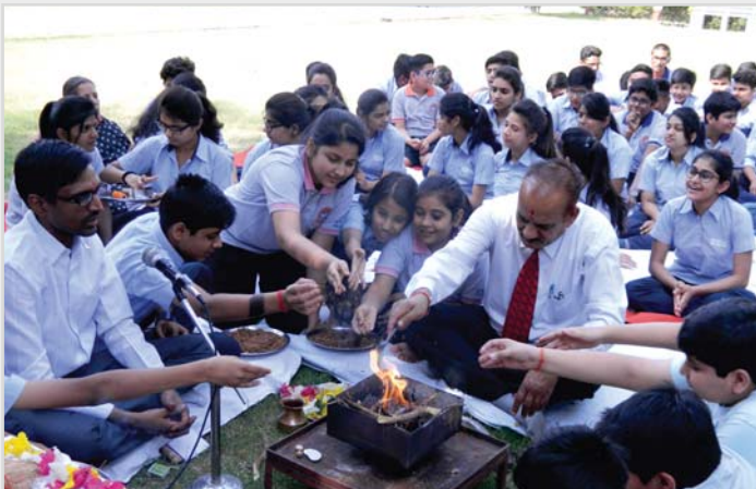
Havan being performed on Shala Pravesh

“ Shala Pravesh ” ceremony was organized on April 2nd 2018, to mark the beginning of the new session. The main objective is to take students on the path of learning which is the culture and tradition of the school. The primary objective behind this is to welcome the new session and to seek the blessings of Goddess Saraswati. On this day ' Havan ' was performed, new students and their parents were invited to be the part of it .