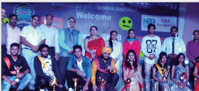
Winners of different Titles with their Trophies