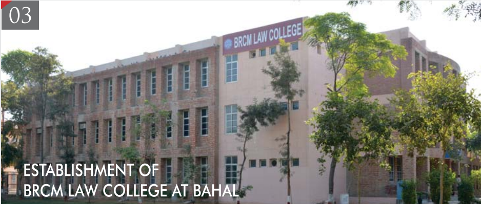
ESTABLISHMENT OF BRCM LAW COLLEGE AT BAHAL