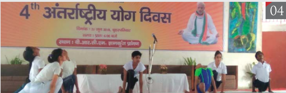
4TH INTERNATIONAL YOGA DAY CELEBRATION