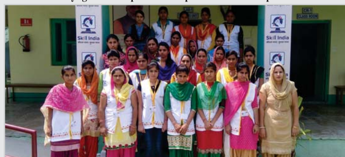
Trainees of Self Employed Tailor of II Batch of PMKVY Course during practical session and Group Photo after completion of Course