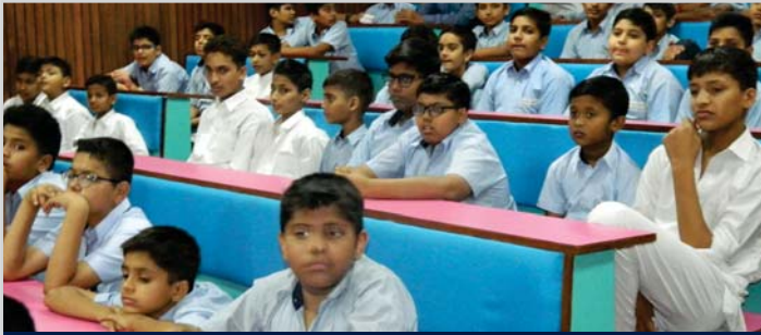
Doha Recitation Competition

The Department of 'Hindi' organized 'Saaransh' an activity week for 'Juniors' and 'Seniors'. Large number of students participated with lot of interest and enthusiasm in various activities like Shirshak Lekhan, Debate, Doha Recitation Competition and Essay Writing Competition. The winners were given appreciation certificates in the assembly.