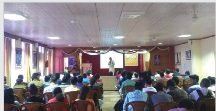
Audience attending the motivational lecture