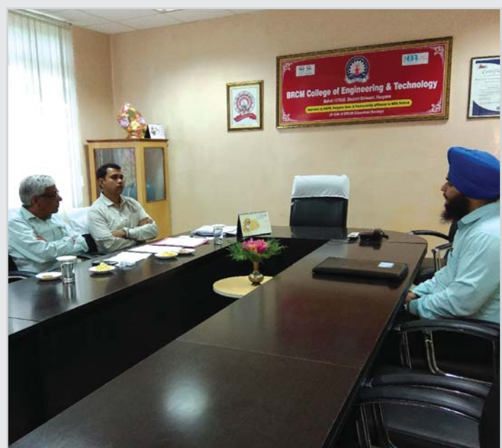
Delegates of Jindal Polybuttons Pvt. Ltd. interacting with students