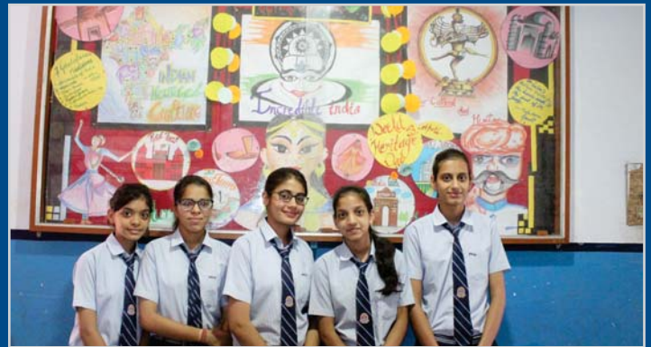
25 May 2018- Inter House Soft Board Decoration Competition