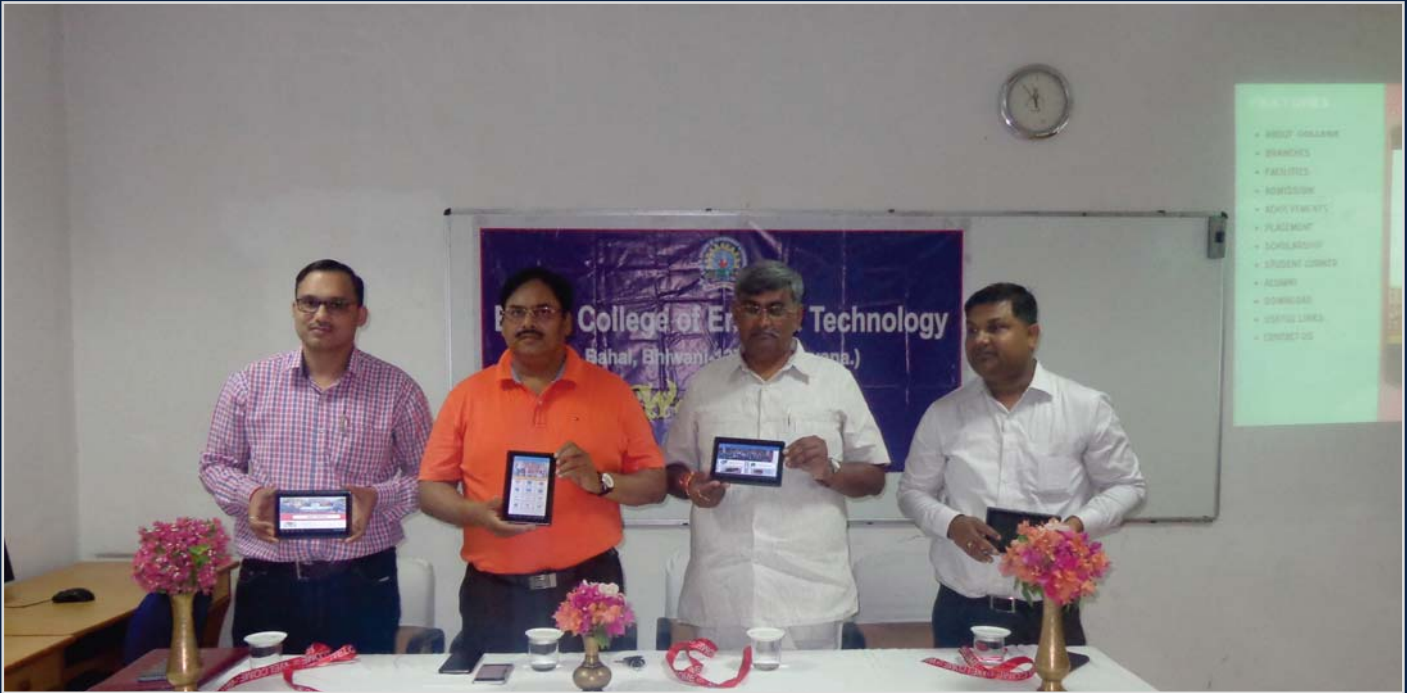
DIGNITARIES LAUNCHING THE 1ST VERSION BRCM CET OFFICIAL ANDROID APPS