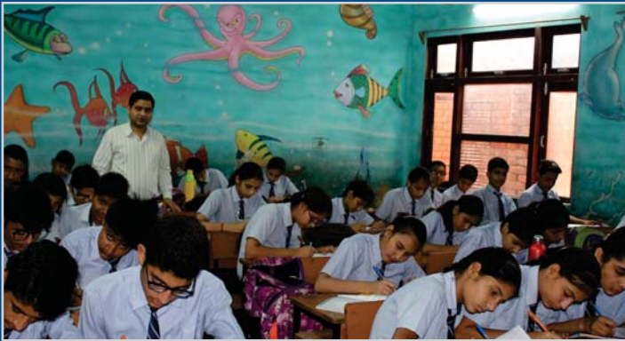
19 April, 2018-An Inter Class English Calligraphy Competition class III to XII