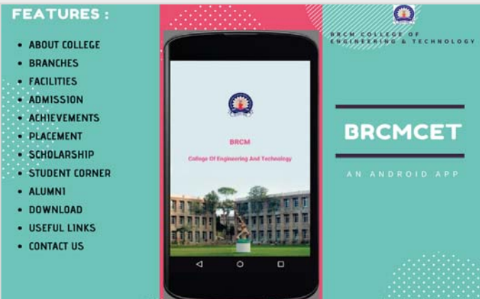
SNAP SHOT OF THE WELCOME PAGE OF ANDROID APPS WITH ITS FEATURES

The apps has a number of function, design, and content enhancement. It allow users to get crucial information about the college such as course, fees, facility, transportation, academic schedules, College schedule, transportation, important phone numbers, and to remain updated on the latest happening in the college. Thus, the apps meant to facilitate fast access to vital information about the college ensuring ease for all the stake holders. In future, it is planned to fully integrate the apps with college ERP. This free app is now live and can be downloaded from college website.