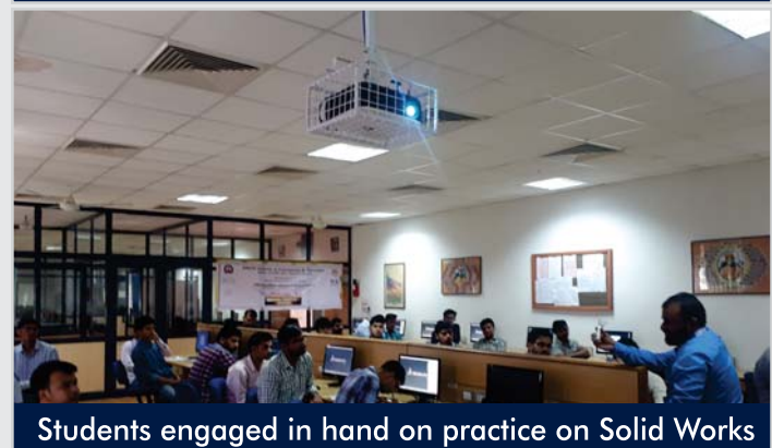
Students engaged in hand on practice on Solid Works