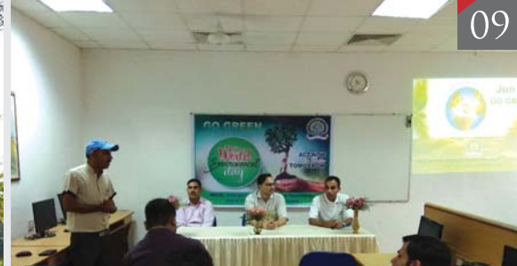
WORLD ENVIRONMENT DAY CELEBRATION