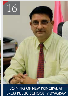
JOINING OF NEW PRINCIPAL AT BRCM PUBLIC SCHOOL, VIDYAGRAM