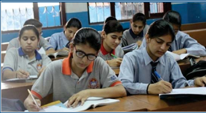
14 April, 2018- Hindi Calligraphy Competition, class III to XII