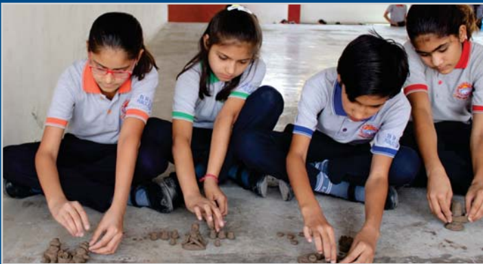
05 May 2018- Inter Class Clay Moulding Competition (Class III to VIII).