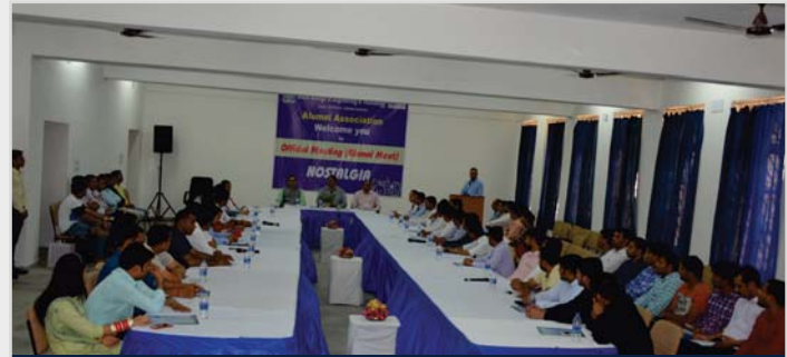
Proceeding of General Meeting of the Alumni Association

All the college alumni decided to help the institute in the areas like industry institute interaction, to deliver the