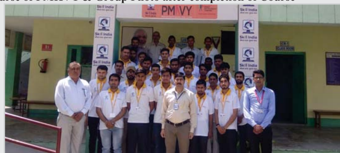
Trainees of Solar Panel Installation Technician Course during visit of Solar Power Plant at Vidyagram Campus & Group Photo after completion of Course