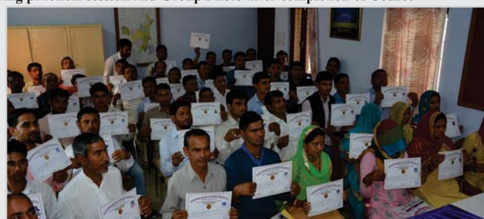
Opening Ceremony of Dairy Development & Animal Husbandry Course and Trainees with their Certificates on completion of Course