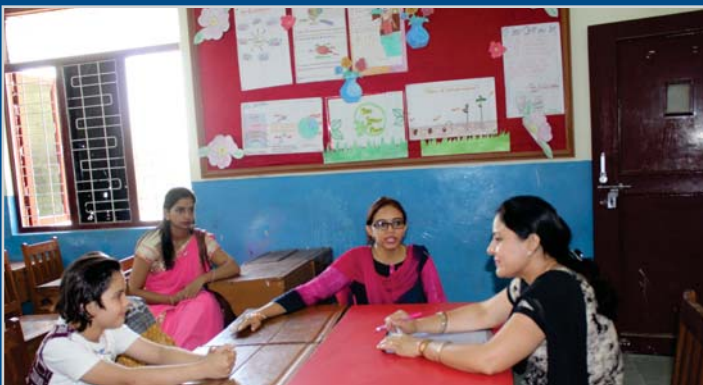
28 May 2018- Parents Teacher Meeting