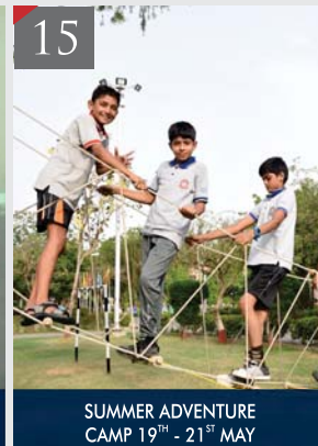
SUMMER ADVENTURE CAMP 19 TH - 21 ST MAY