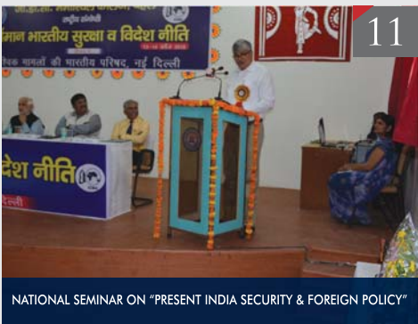
NATIONAL SEMINAR ON "PRESENT INDIA SECURITY & FOREIGN POLICY"