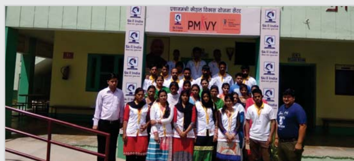
Assessment of Field Technician Computing & Peripherals Course of PMKVY & Group Photo after completion of Course