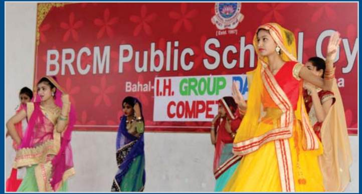
05 May 2018- Inter House Group Dance Competition