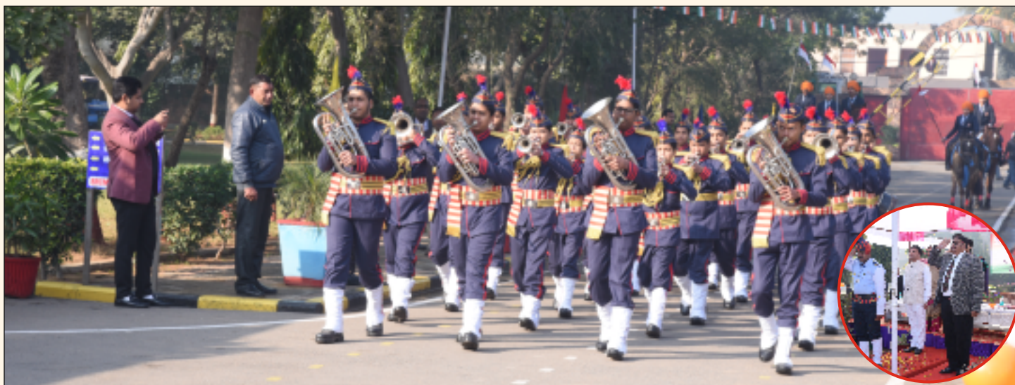
The School Brass Band