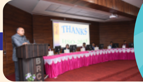
Prize Distribution of Haryana Science Olympiad