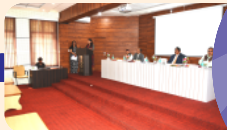
International Womens Day Celebration