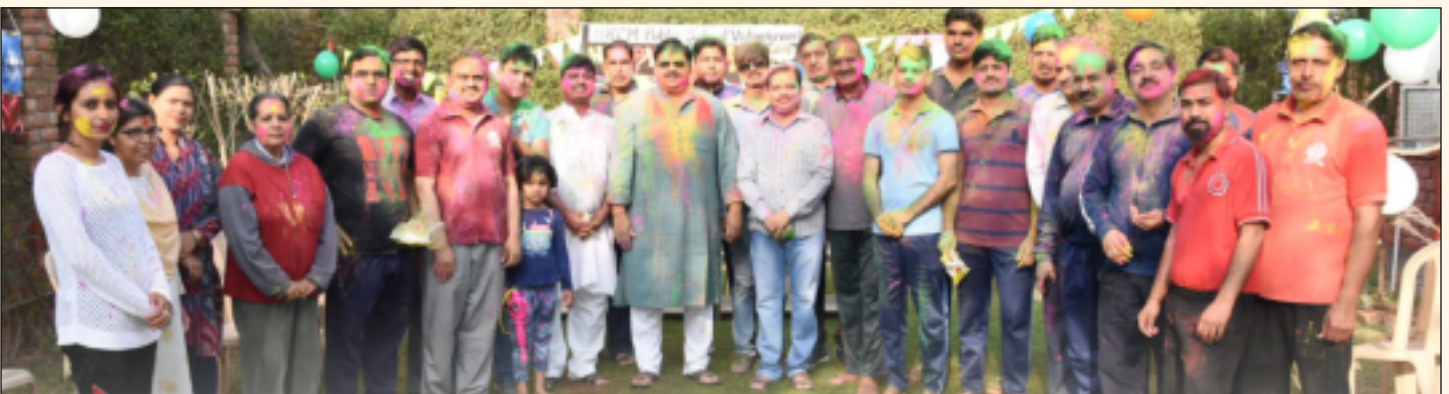
Smearing Faces of the staff - At Principal's Green