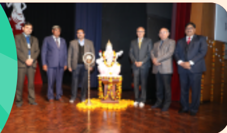
Three Days International Conference - ICABS 19