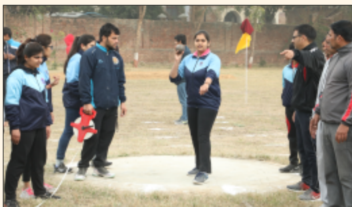
Shot Put - Test of Power