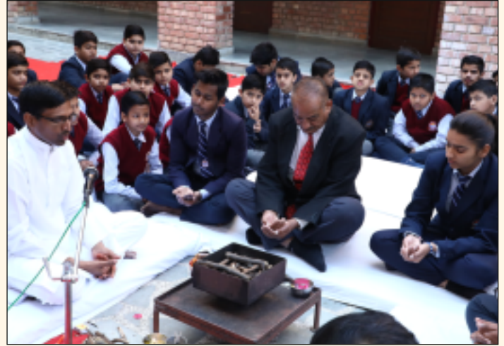
Havan for CBSE Board Exam 2018-19