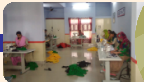
"BRCM Tailoring Unit" at a Glance