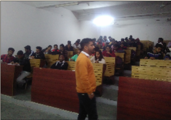
Glimpse of the proceedings of the workshop on Hadoop

“Programs must be written for people to read, and only incidentally for machines to execute.”— Harold Abelson: