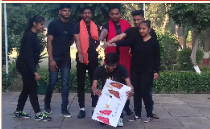
Students performing a “Street Play”

“A Nation's Culture Resides In the Hearts and in the soul of its people” Mahatma Gandhi:-