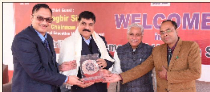
Honoring the Guest of Honor