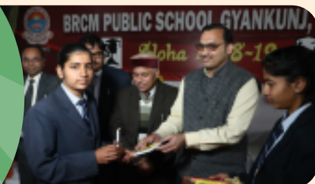
"ALOHA" - Farewell of Class XII, BRCM Gyankunj