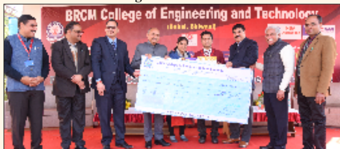
Awarding prize to the winner