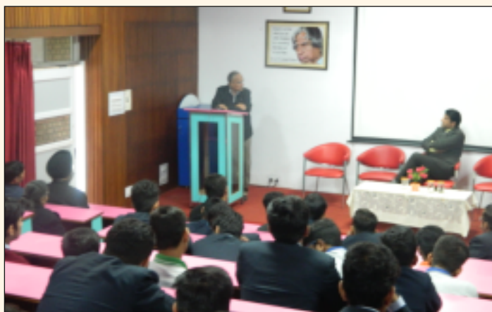
Workshop in Progress