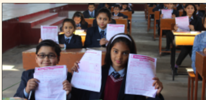
HBTSE exam conducted by RAAH Group Foundation on 22.01.2019.