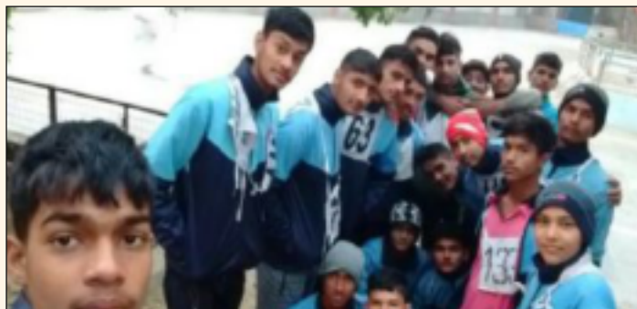
NCC cadets participated in "A" Certificate Exam on 17.01.2019