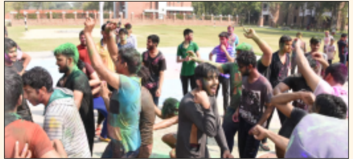
Staff & Students Enjoying Foot Tapping Dance on Holi