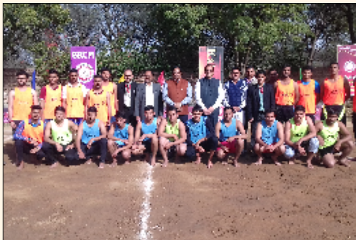
Participating Students with officials

The Department of Games and Sports of BRCM CET, Bahal organized a “Kabaddi” tournament during 11-03-2019 to 13-03-2019 in which total four teams participated and out of which three teams were from BRCM CET named as BRCM Spartan, BRCM Strikers, BRCM Hunters and one team was from BRCM Law College named as Law Group. The final match took place between BRCM Spartan and Law Group in which BRCM Spartan came out as winner with Law Group as Runner up. All the matches of the Tournament were played with great sports spirit and were enjoyed by all staff members and students.