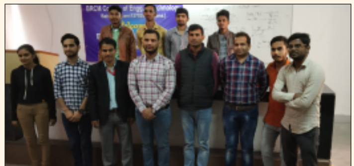
A snapshot after completion the workshop