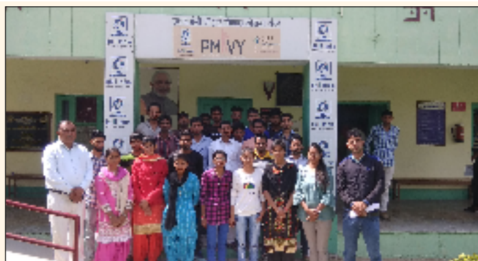
Candidates after final assessment of “Executive Customer Care (Relationship)” Training Programme sponsored by NSDC at BRCM Skill Development Training Center with assessor.