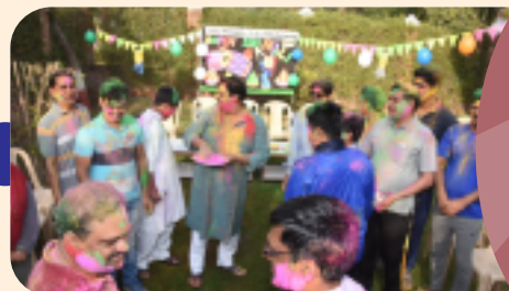
Holi Celebration at Vidyagram Campus