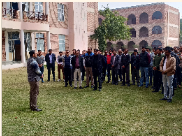
Gathering of Staff and students in condolence meeting