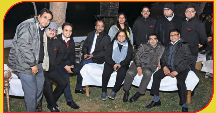
Team Vikram Solar enjoying the Kalbeliya Night