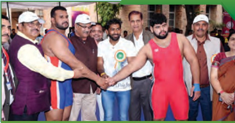
All India Inter University Wrestling Championship