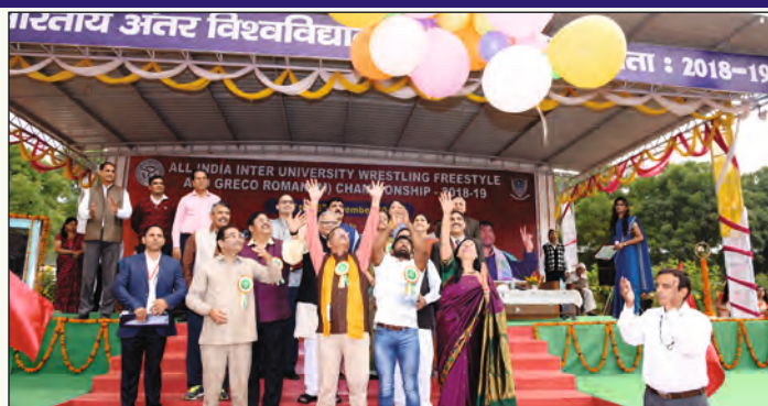
Release of Balloons by Dignitaries

The game has its ups and downs, but you can never lose focus of your individual goals and you can't let yourself be beat because of lack of effort. Michael Jordan .