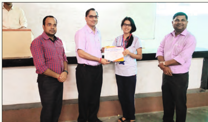
Winners of online event DARPAN