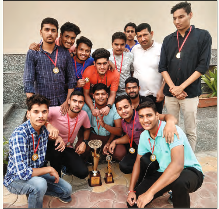
Students & Staff with Trophy

“It always seems impossible until it’s done. Nelson Mandela” To bring out the possible from impossible Champions of BRCM College of Engineering & Technology participated in two days Cricket & Volleyball Championship at Delhi Technical Campus, Bahadurgarh from 2nd to 3rd November, 2018 and won Gold medal in both the championships. The college management and staffs congratulate the teams for bringing glory to the college.