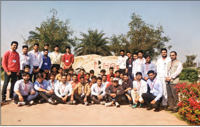
Students and staff members at Hero Moto Corp Ltd.

Training and Placement Cell organized an industrial visit to Hero Motor Corp, Neemrana on 24th Nov, 2018 with the objective to explore the various aspects of manufacturing processes in Auto industry. Forty five students from ME, EEE and CSE along with two faculty members participated in this industrial visit. Students acquainted with detailed processes of casting, welding, machining, painting and the intervention of automation in all these processes. The most interesting part was to watch the assembly line wherein all these processes take place sequentially to transformed the raw material into a automobile ready to move on road. It was highly informative and inspiring visit.