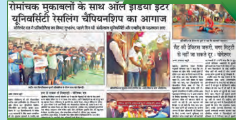
BRCM in Media at a Glance