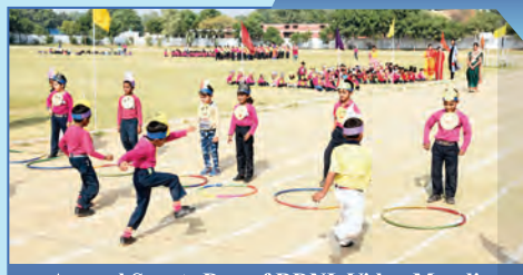
Annual Sports Day of RDNL Vidya Mandir