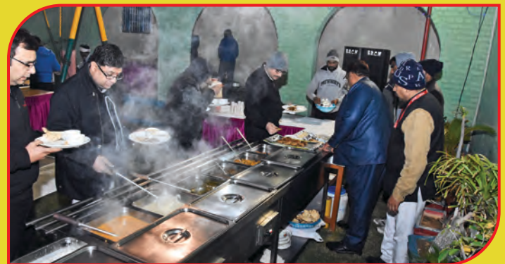
Delegates & Guests Enjoying Dinner Party