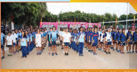
All India IPSC Volleyball Girls Championship - 2018