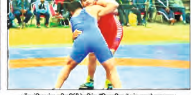
ऑल इंडिया इंटर यूनिवर्सिटी रेसलिंग चैंपियनशिप में दौब लगाते पहलवान।