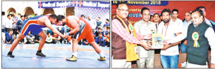
बहल। प्रतियोगिता में दमखम दिखाते पहलवान तथा अन्तरराष्ट्रीय खिलाड़ी योगेश्वर दत्त को सम्मानित करते हुए।