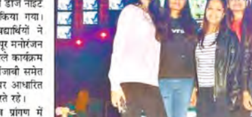
बहल के बीआरसीएम में रैप पर कैंटवॉक करती छ