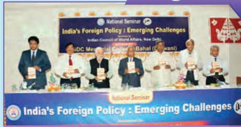
Two Days National Level Seminar