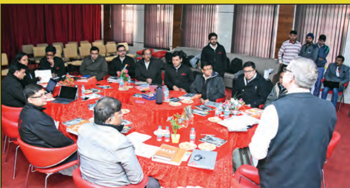
ABP Session 2019-20 in progress