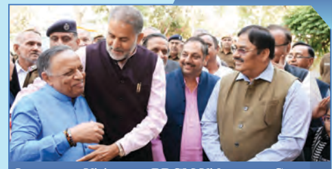
Important Visitors at BRCM Vidyagram Campus