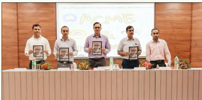
Officials releasing the 6th volume of MES magazine Mechanica

“Will is nothing more than a particular case of the general doctrine of association of ideas, and therefore a perfectly mechanical thing. Joseph Priestley” This idea is brought in to reality every year by ME society by organizing its annual Tech fest "ACME-2018" on 17th and 18th October, 2018. This was the 6th glorious years of "ACME" which was organized with great pride and zeal. During the auspicious occasion, the sixth volume of annual technical magazine of MES, 'MECHANICA 2017-2018' was also released. The events studded with various technical events such as PPT and aptitude test, logo Quiz, Machine operation, GD & PI, Math Quiz etc. Some nontechnical and fun events like Treasure hunt and races, Galli Cricket etc were also centre of attraction of this event. MES achieved milestone with over 120 participants in aptitude test and over 200 participants in ACME-2018. The winners of various events were awarded with trophies, medals and Case Prize during closing ceremony. Finally, in the presence of Principal, HOD and faculty advisor, MES the officer bearers of MES for the new session were placed on record.