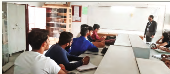
Experts delivering the lectures workshop on PLC

“Programs must be written for people to read, and only incidentally for machines to execute.” — Harold Abelson , To bring it in practice a one day workshop on “ Python Programming ” organized for students of CSE Students on 16th October, 2018 to explore the power and simplicity of python language in association with APTRON Delhi. The Structure of the workshop was about Modules in Python and Writing your own code. The trainer, Mr. Deepak Chauhan, is the member of APTRON of India has given mix of theory and practical knowledge. This workshop was appreciated by the all students, as they were able to add another programming language in their technical skill set.