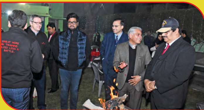
Guests enjoying the Bonfire in chilling cold weather