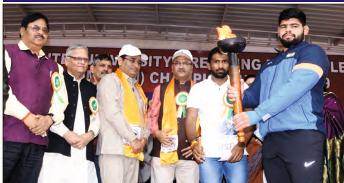
Lighting of Olympic Flame