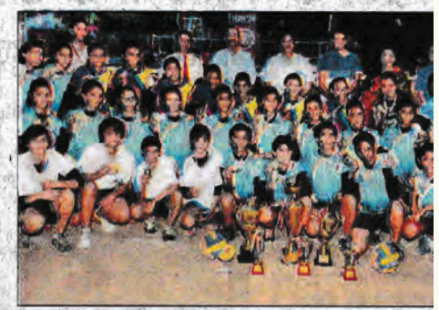
एस.के.सिन्हा स्मृति चिह्न