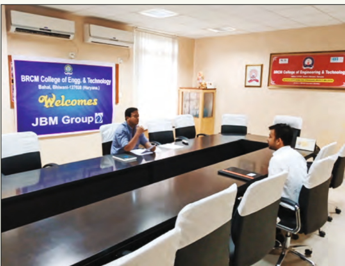
Students and staff members at Hero Moto Corp Ltd.

Training and Placement Cell organized an industrial visit to Hero Motor Corp, Neemrana on 24th Nov, 2018 with the objective to explore the various aspects of manufacturing processes in Auto industry. Forty five students from ME, EEE and CSE along with two faculty members participated in this industrial visit. Students acquainted with detailed processes of casting, welding, machining, painting and the intervention of automation in all these processes. The most interesting part was to watch the assembly line wherein all these processes take place sequentially to transformed the raw material into a automobile ready to move on road. It was highly informative and inspiring visit.