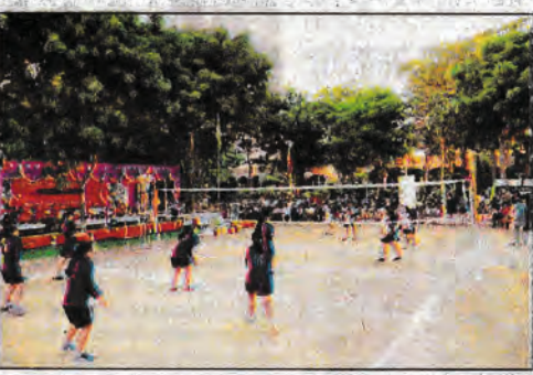
बहल। प्रतियोगिता में दमखम दिखाते खिलाड़ी व विजेताओं को बधाई। विजय रही टीमों को मुख्य अतिथि व निदेशक ने मेडल, ट्रॉफी व