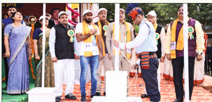
Flag Hoisting during Opening Ceremony