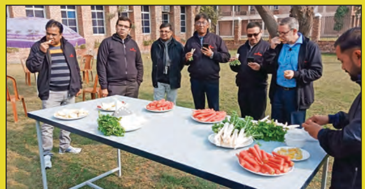
Delegation enjoying Organic Fruits & Vegetables