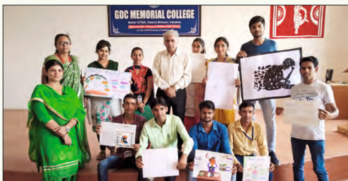
Chart-Making & Presentation Competition