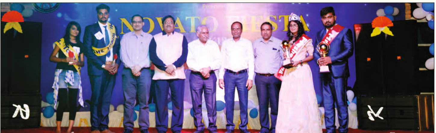
Mr. & Ms. Fresher and Mr. Talent & Ms. Talent with Dignitaries