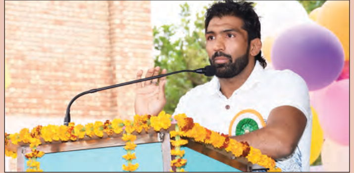
Padmashri & Olympian Sh. Yogeshwar Dutt (Wrestling)