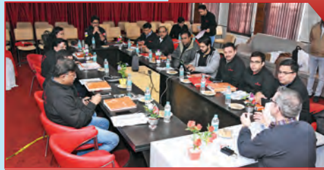
Annual ABP Meet of Vikram Solar Pvt. Ltd.