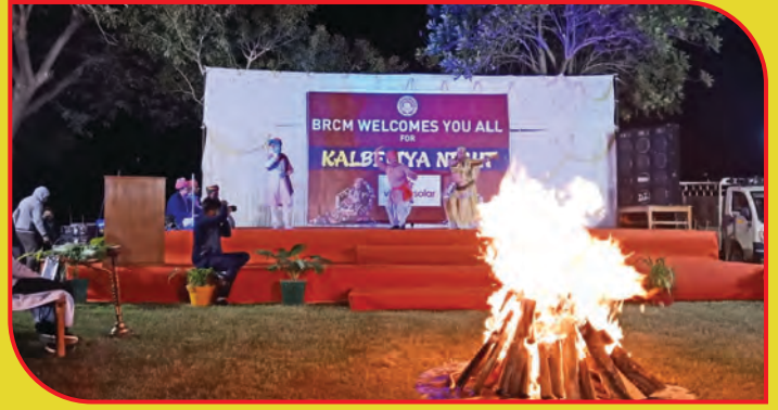
Rajasthani Folk Dance & Bonfire