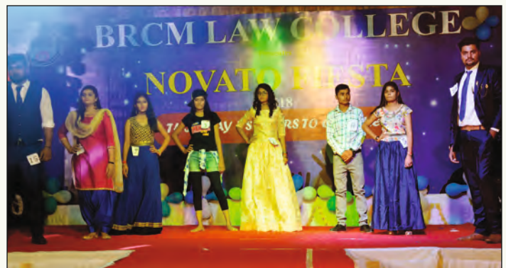
Final Round of students for various Titles