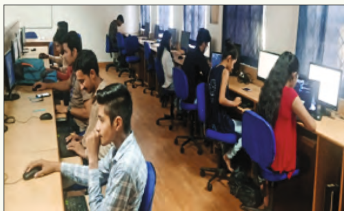
Participating students during the workshop on Revit