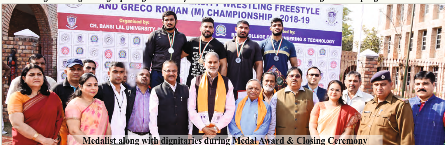
Medalist along with dignitaries during Medal Award & Closing Ceremony