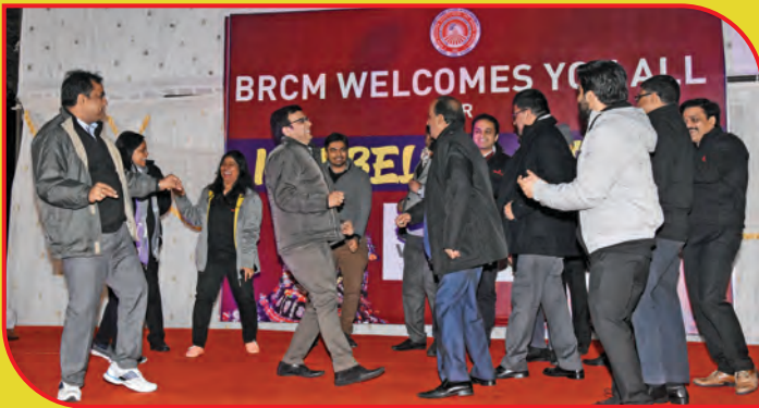
Dance Performance by Team Vikram Solar