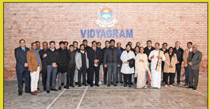
Delegation of Vikram Solar along with Team BRCM